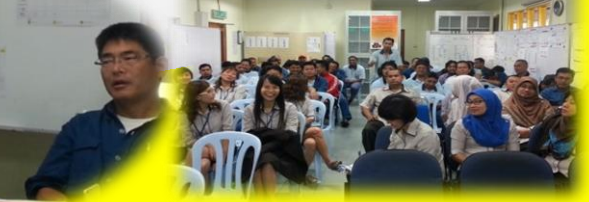
7 issues was raised by employees.