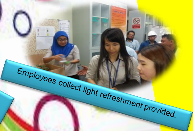
Employees collect light refreshment provided.